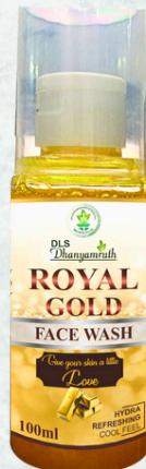
DLS ROYAL GOLD FACE WASH