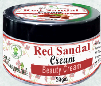
RED SANDAL FACE CREAM