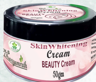
SKIN WHITENING BEAUTY CREAM