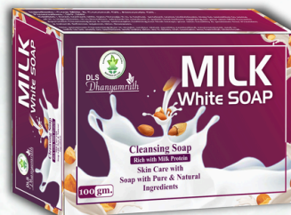
DLS MILK WHITE SOAP