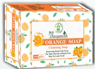
DLS ORANGE SOAP