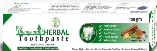
DLS HERBAL TOOTHPASTE